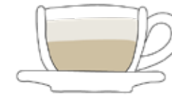
FLAT WHITE 2 SHOTS