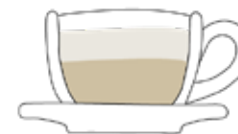
CORTADO 2 SHOTS