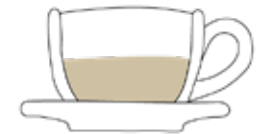
ESPRESSO 2 SHOTS