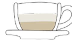
CAPPUCCINO 1 SHOT