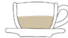
ESPRESSO MACCHIATO 2 SHOTS