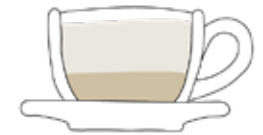
LATTE 1 SHOT | BIG CUP