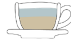
AMERICANO 2 SHOTS