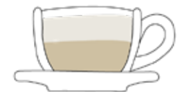
LATTE DOUBLE 2 SHOTS | BIG CUP